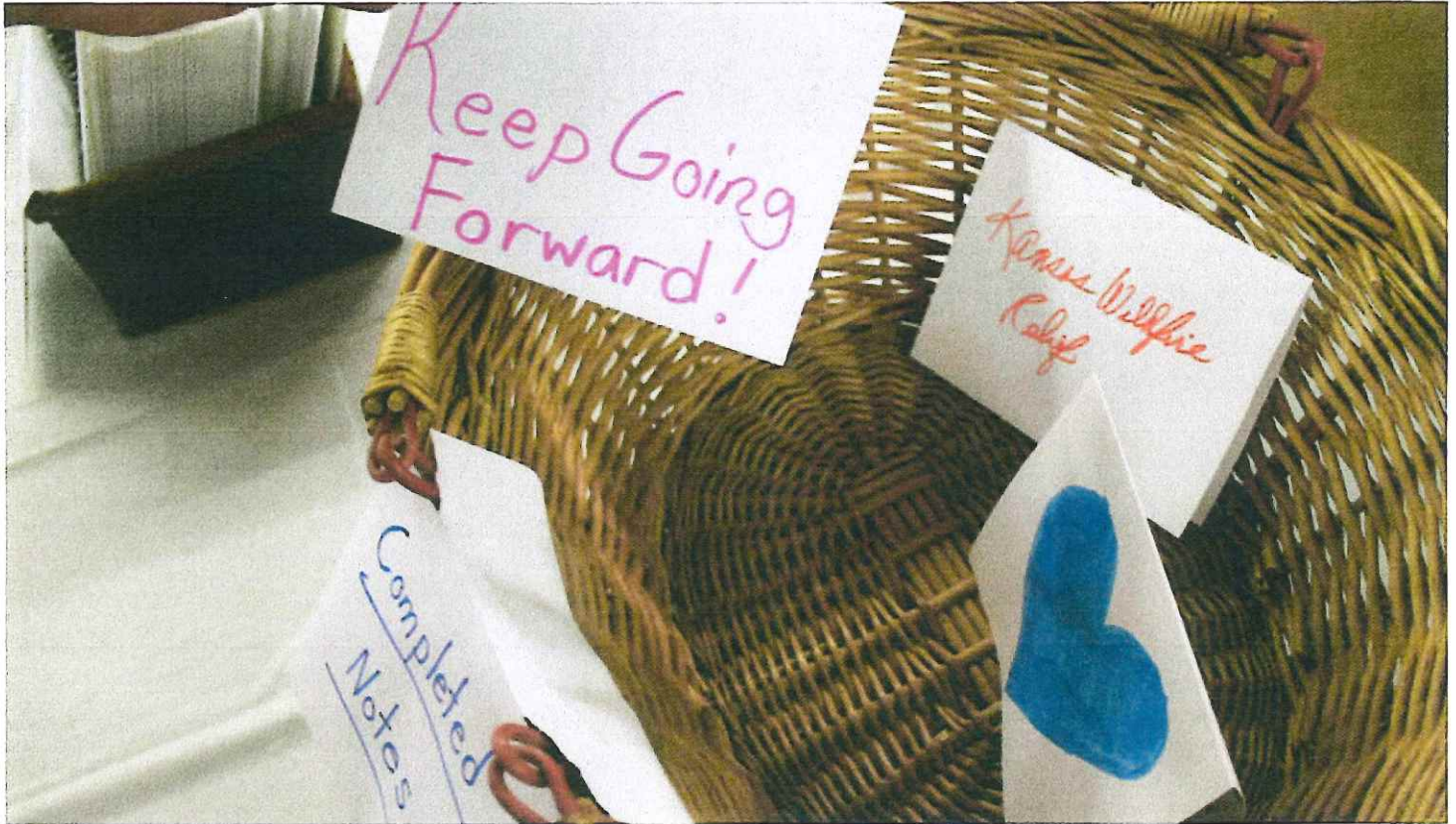
One of the efforts for the disaster relief project is for 4-H members in Stutsman County to write notes of encouragement to the Kansas ranchers hit by wildfires in March. Photo taken June 29, 2017, at Jamestown, N.D.